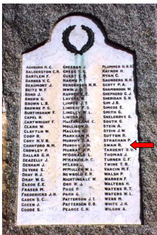
Roma War Memorial